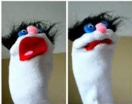
glue on eyes, nose & hair