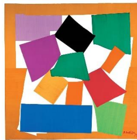
The Snail, 1953 by Henri Matisse.

Look carefully at the art below. Now create your own collage of a flower (rip, tear and glue paper) inspired by this artwork.